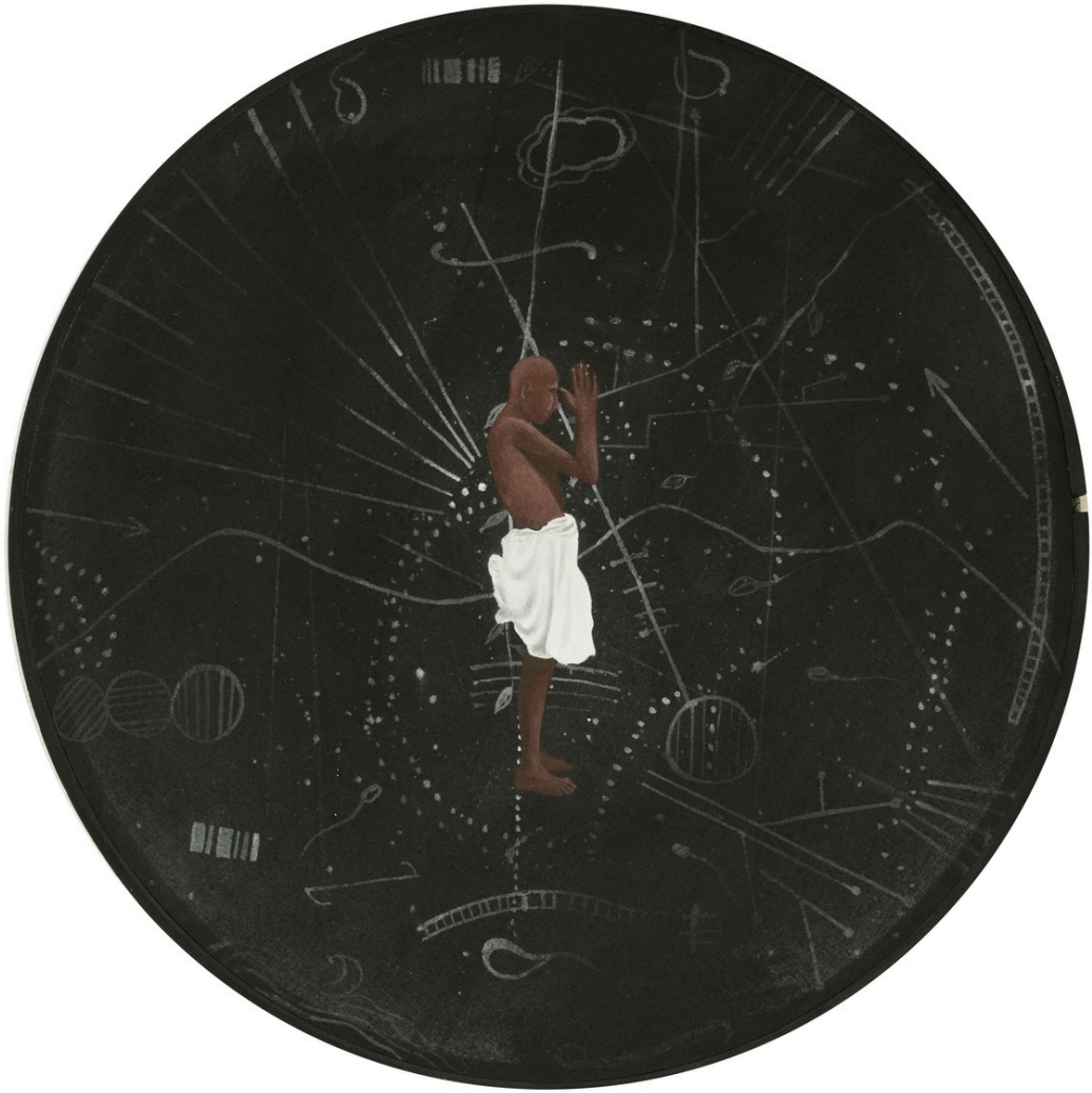
Black Dot II Gouache on canvas 18 x 18 inches