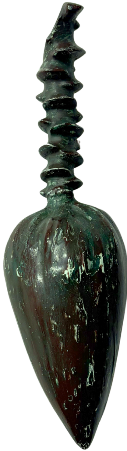
Banana Heart Painted fibreglass 3 x 3,5 x 12 inches