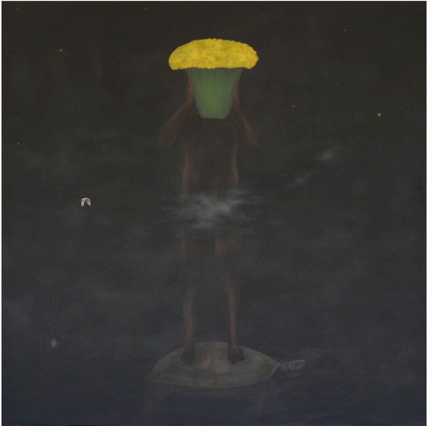
The Slow Gouache on canvas 72 x 72 inches