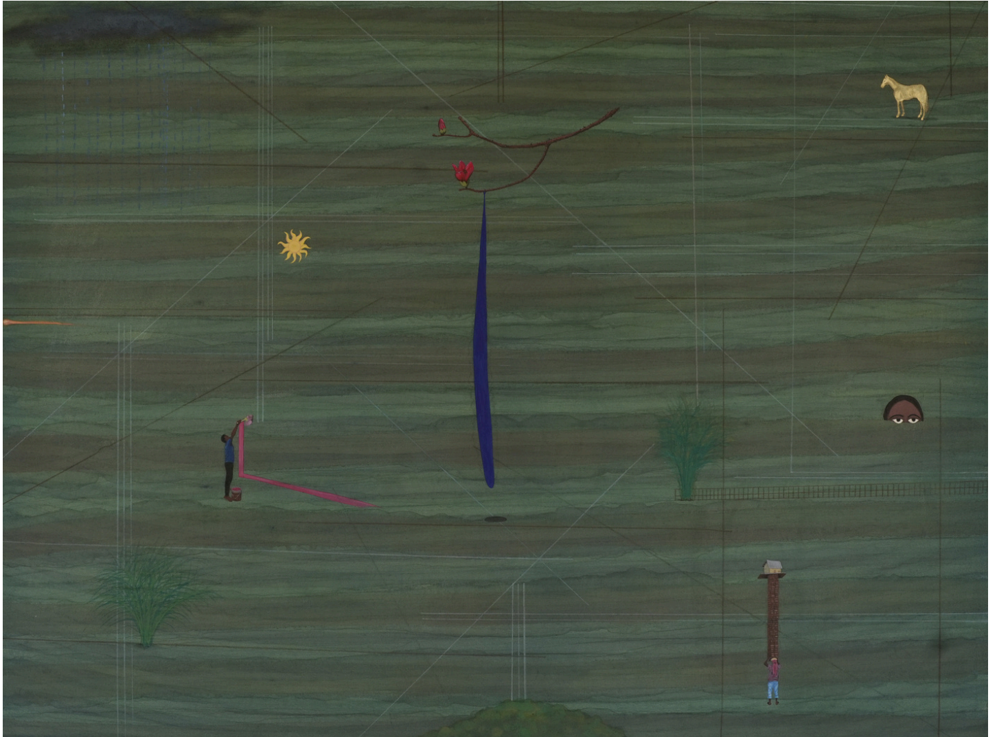
The Lines Gouache on canvas 48 x 36 inches