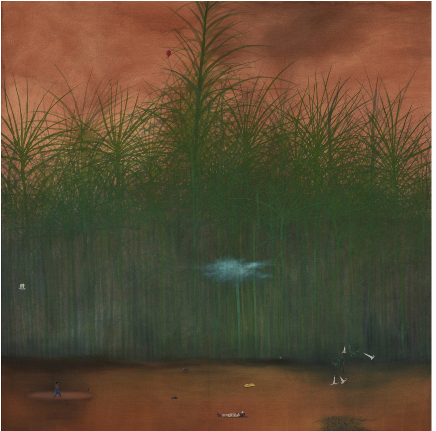
The Land Speaks Softly Gouache on canvas 72 x 72 inches