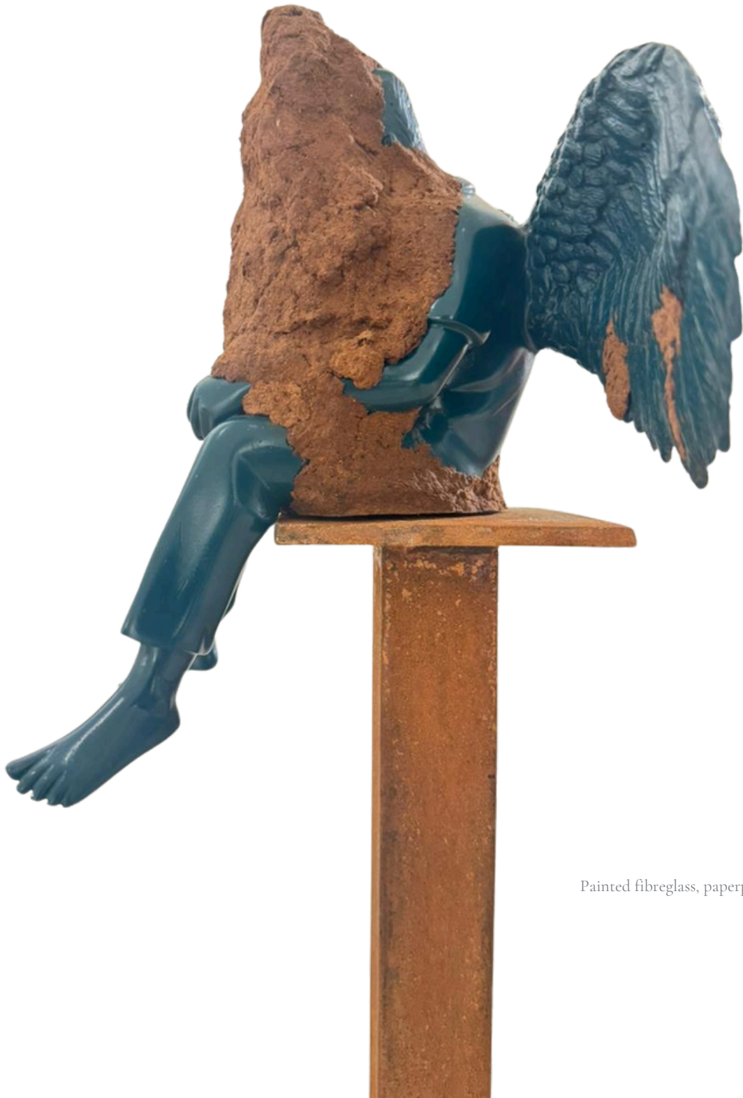
Wings of Desire Painted fibreglass, paperpulp, brickdust and steel 13 x 6 x 11 inches