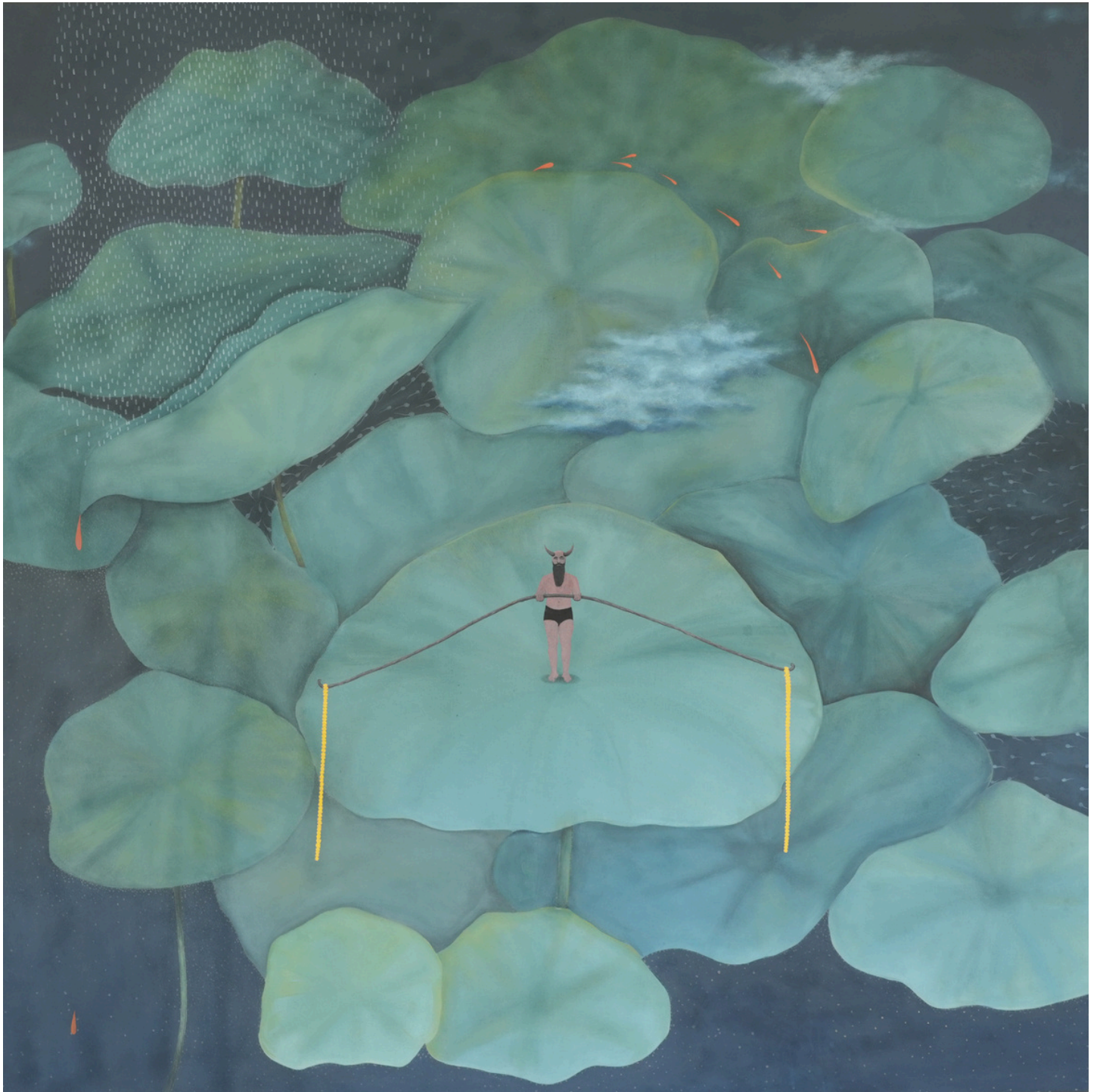
Within Gouache on canvas 72 x 72 inches