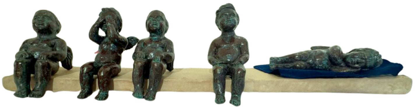
Dreamers Painted fibreglass, satin cloth, ceramic plate and wood 2 x 2.5 x 4.5 inches each (Set of 5)