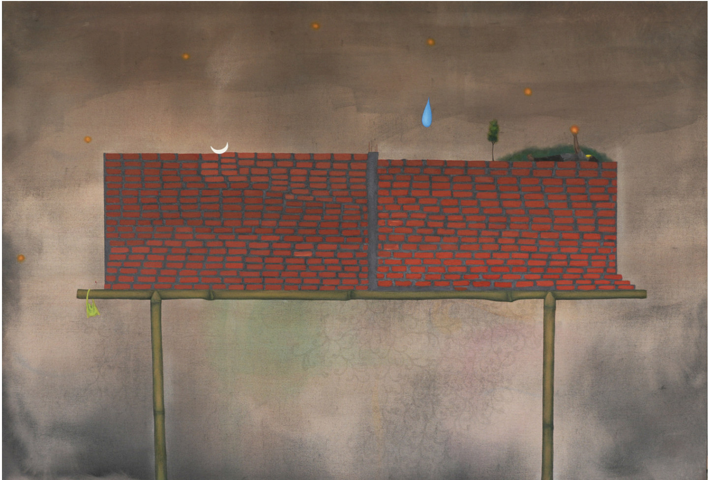
Each Brick tells Oil and acrylic on canvas 60 x 42 inches