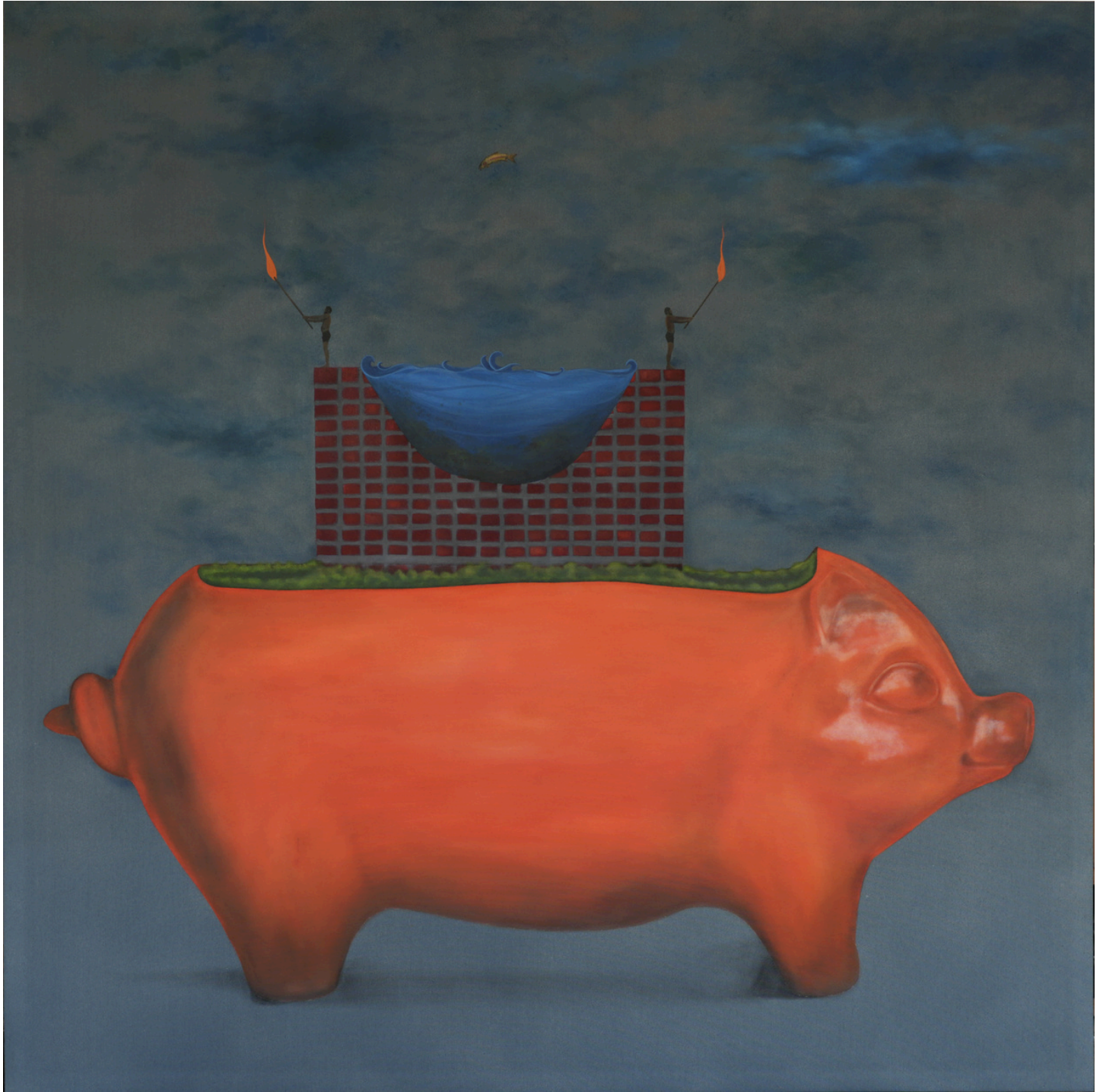
The Red Pig Oil and gouache on canvas 72 x 72 inches